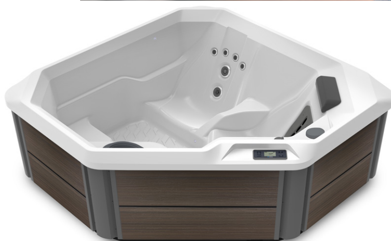
Shown with Alpine White Shell and Havana Cabinet.