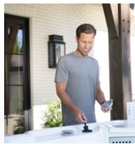
FreshWater® Salt System Ready