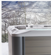
FiberCor® High-Density Insulation