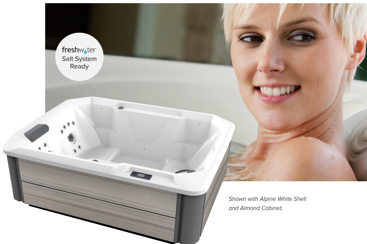
Shown with Alpine White Shell and Almond Cabinet.