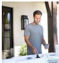
FreshWater® Salt System Ready