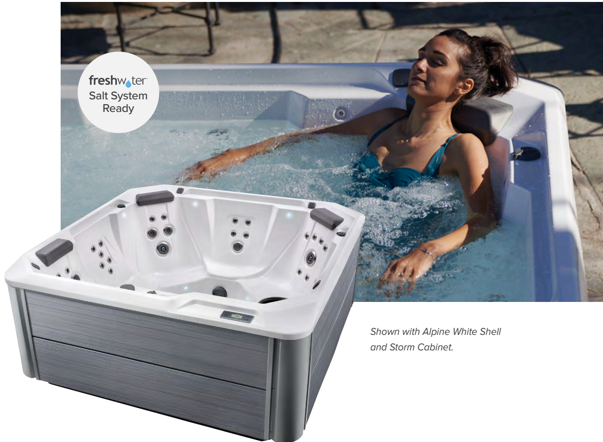
Shown with Alpine White Shell and Storm Cabinet.