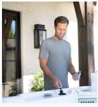
FreshWater® Salt System Ready