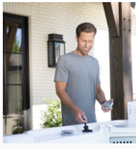
FreshWater® Salt System Ready