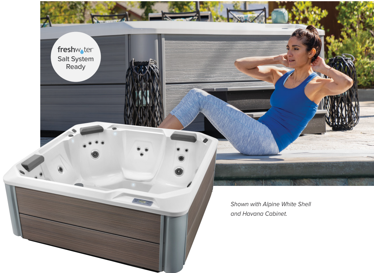
Shown with Alpine White Shell and Havana Cabinet.