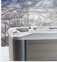
FiberCor® High-Density Insulation