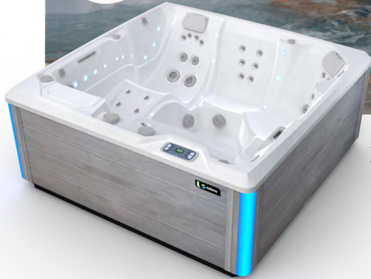
Shown with Alpine White Shell and Coastal Grey Cabinet