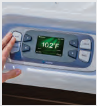
Colour LCD Display