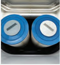
Dual Action Filtration SilentFlo Circulation