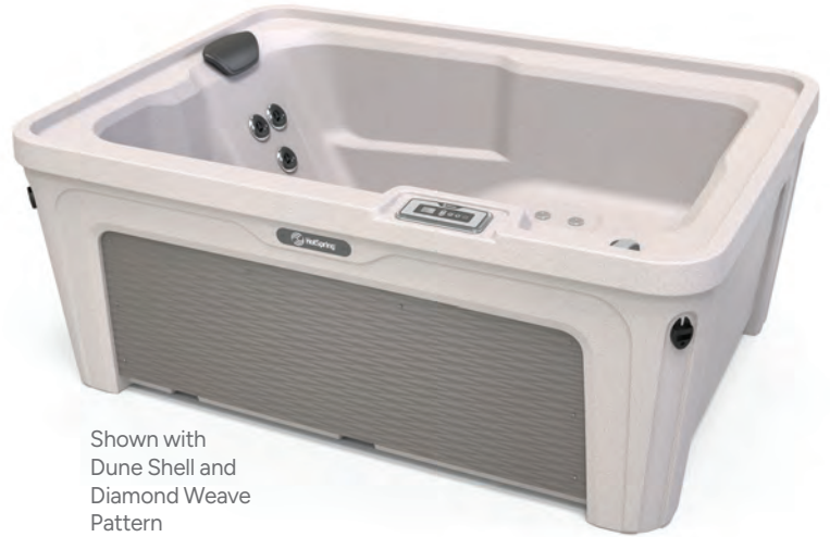
Shown with Dune Shell and Diamond Weave Pattern