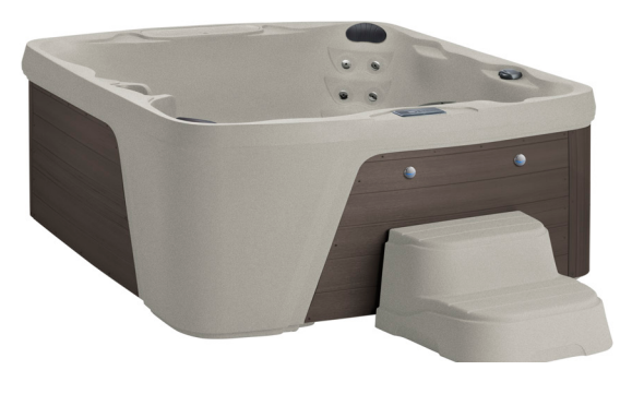
Monterey shown in Sand / Brown with built-in ice bucket