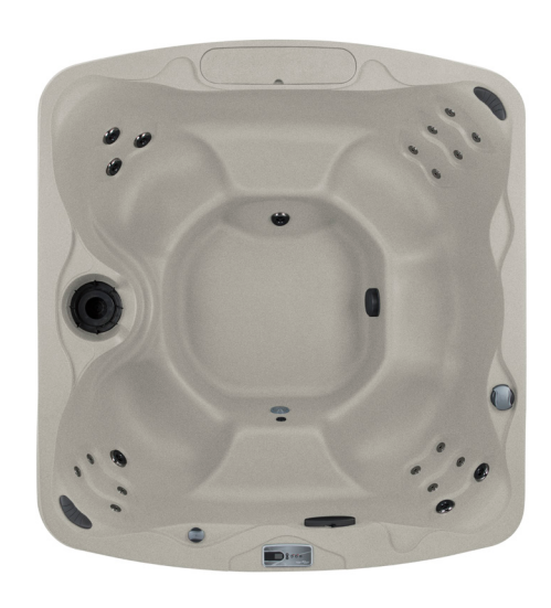
Monterey shown in Sand