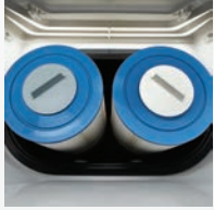
Dual Action Filtration SilentFlo Circulation