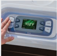
Color LCD Display