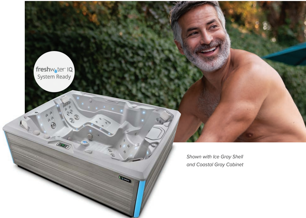
Shown with Ice Gray Shell and Coastal Gray Cabinet

People Seating Jets Voltage 7 Seats Lounge 73 Jets 230 V