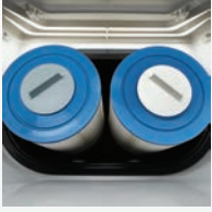
Dual Action Filtration SilentFlo Circulation