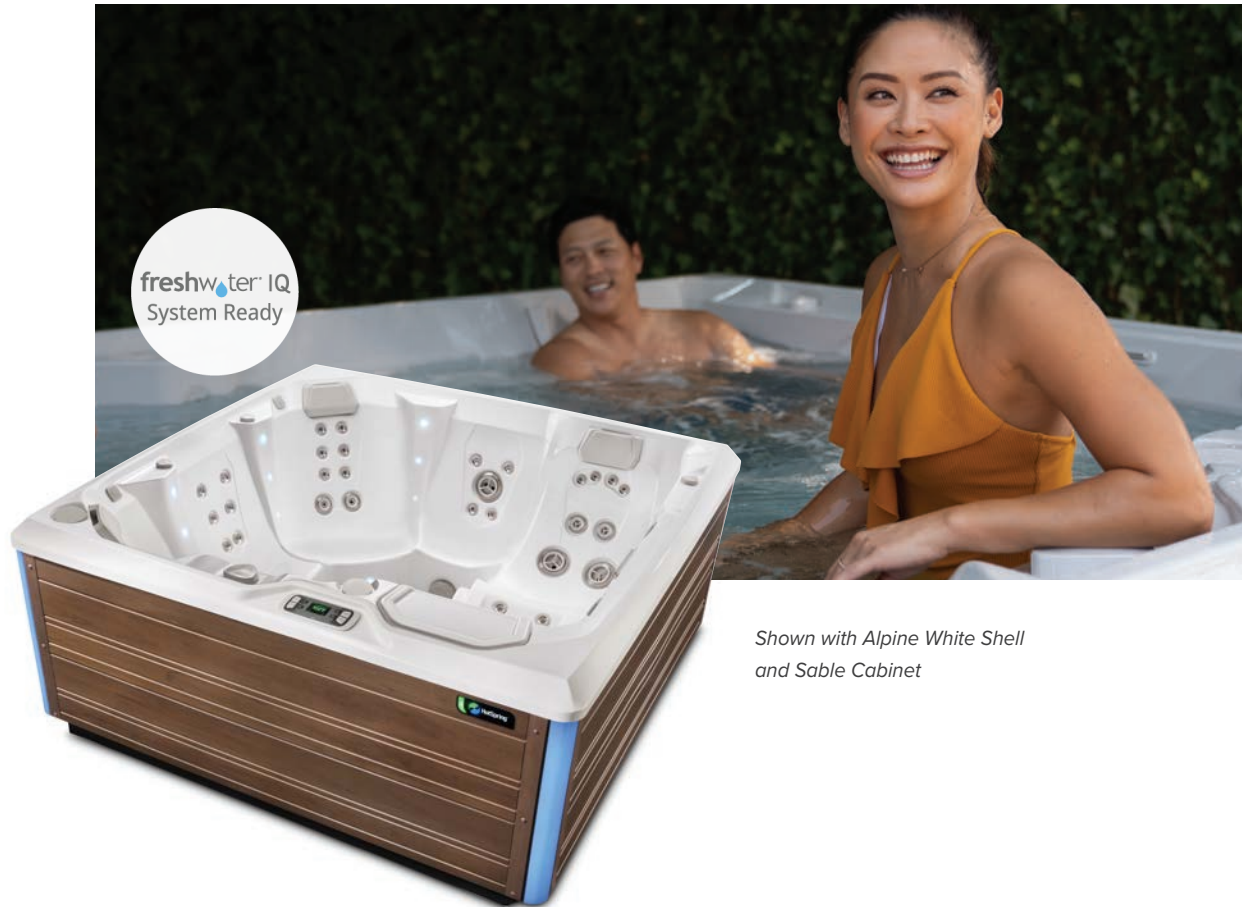
Shown with Alpine White Shell and Sable Cabinet

People Seating Jets Voltage 6 Seats Lounge 43 Jets 230 V