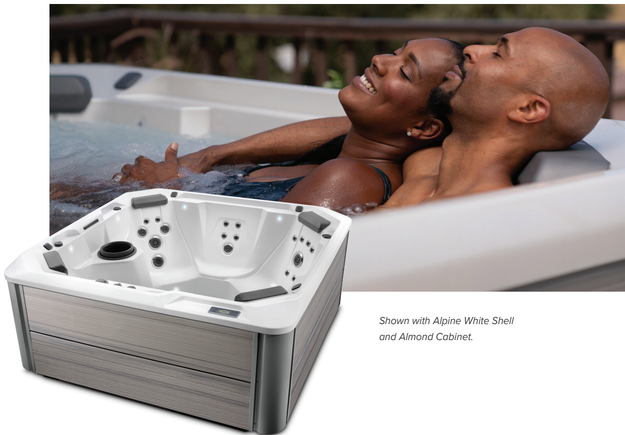
Shown with Alpine White Shell and Almond Cabinet.