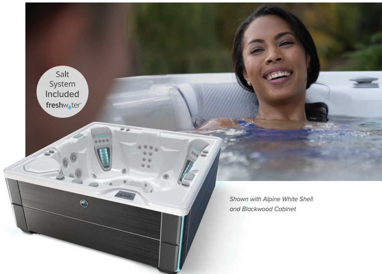
Shown with Alpine White Shell and Blackwood Cabinet

People Seating Jets Voltage 6 Seats Open 42 Jets 230 V