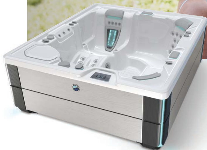
Shown with Alpine White Shell and Brushed Nickel Cabinet

People Seating Jets Voltage 5 Seats Lounge 32 Jets 230 V