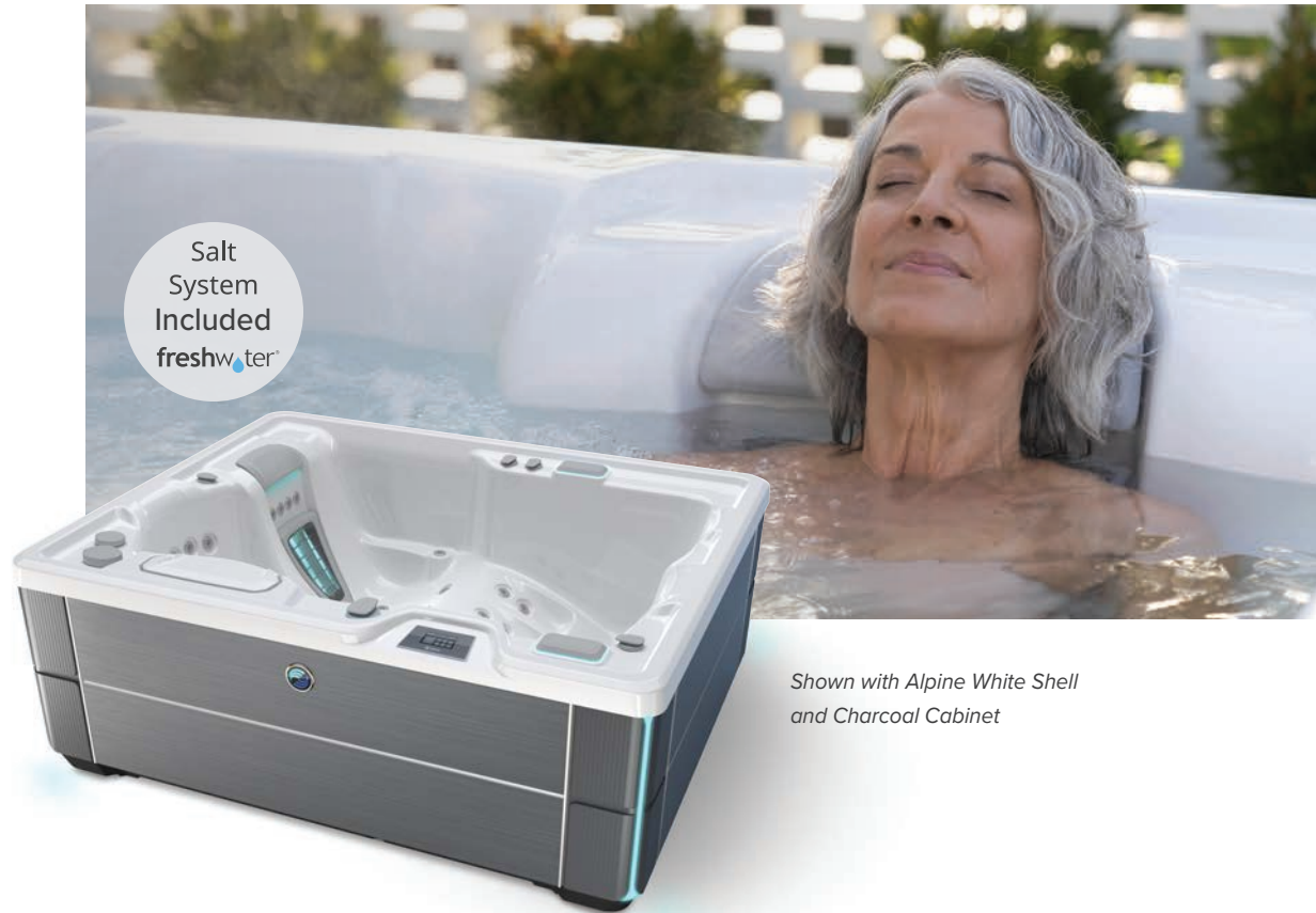
Shown with Alpine White Shell and Charcoal Cabinet

People Seating Jets Voltage 3 Seats Lounge 30 Jets 230 V