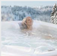
Super Energy Efficient