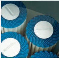
100% Filtration SilentFlo Circulation