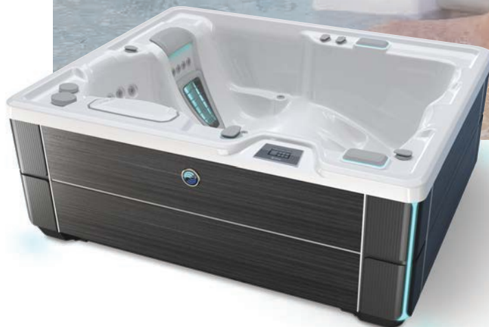
Shown with Alpine White Shell and Blackwood Cabinet

People Seating Jets Voltage 3 Seats Lounge 22 Jets 230 V