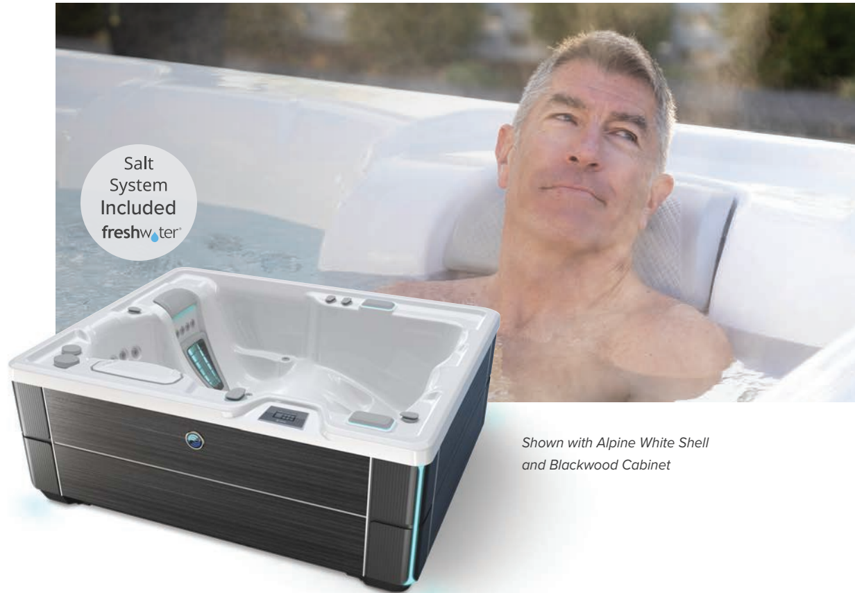
Shown with Alpine White Shell and Blackwood Cabinet

People Seating Jets Voltage 3 Seats Lounge 22 Jets 230 V