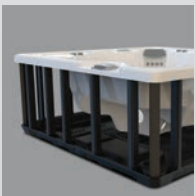
Polymer Substructure & Base Pan