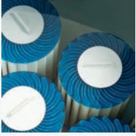
100% Filtration SilentFlo Circulation