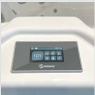
Color LCD Touchscreen