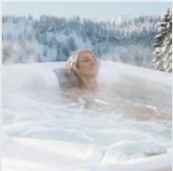
Super Energy Efficient