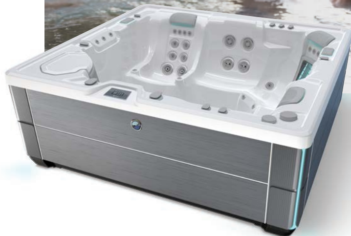
Shown with Alpine White Shell and Charcoal Cabinet

People Seating Jets Voltage 5 Seats Lounge 55 Jets 230 V