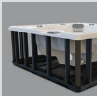
Polymer Substructure & Base Pan