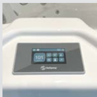
Color LCD Touchscreen