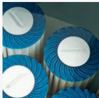
100% Filtration SilentFlo Circulation