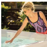
FreshWater® IQ System Ready