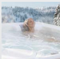
Super Energy Efficient