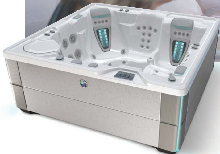
Shown with Alpine White Shell and LinenCabinet

People Seating Jets Voltage 5 Seats Lounge 42 Jets 230 V